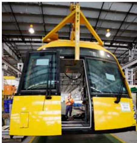
Waratahs in production

“Keeping in close touch with ICN has really paid off.”